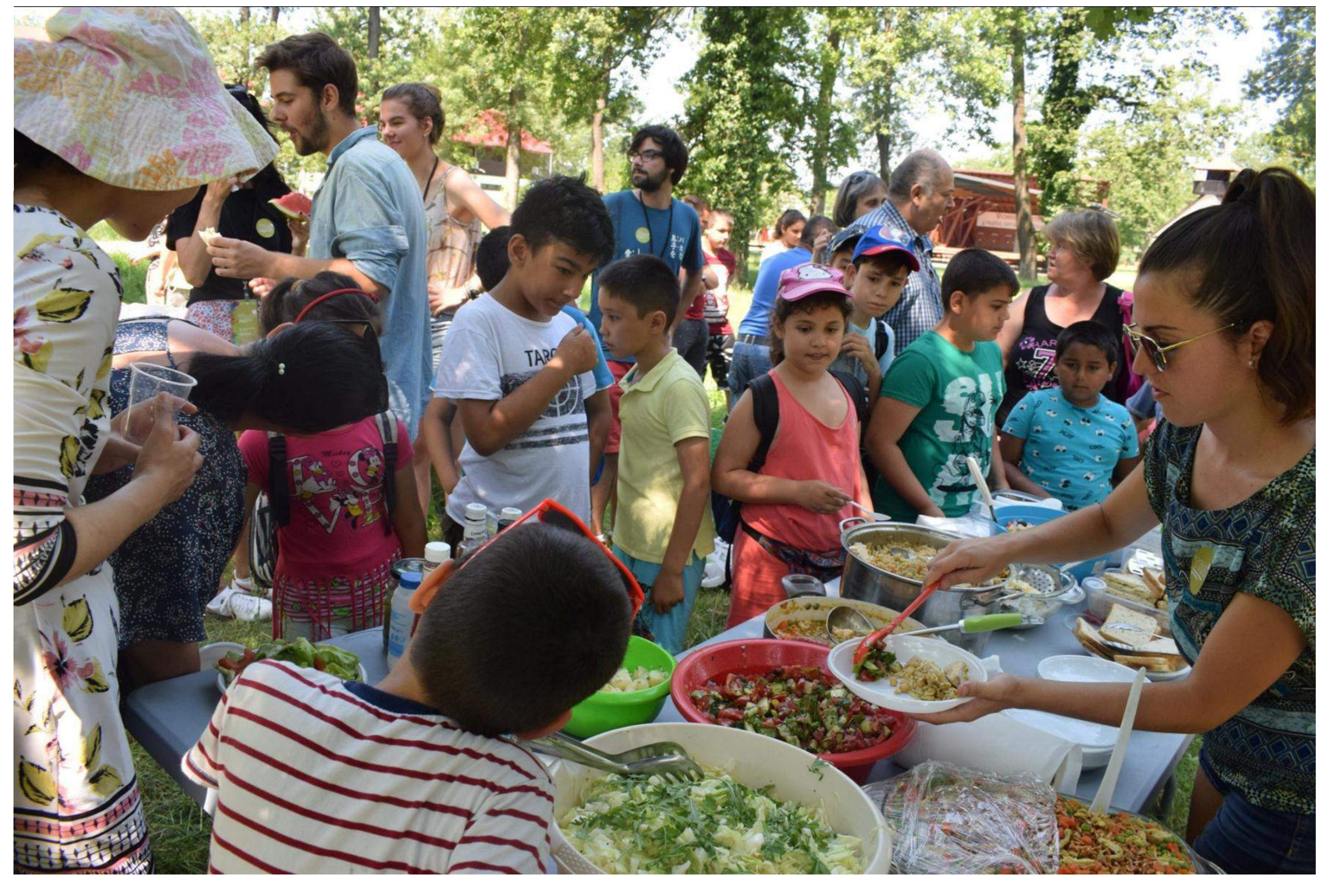
TRAF #3: Community Intercultural Picnic