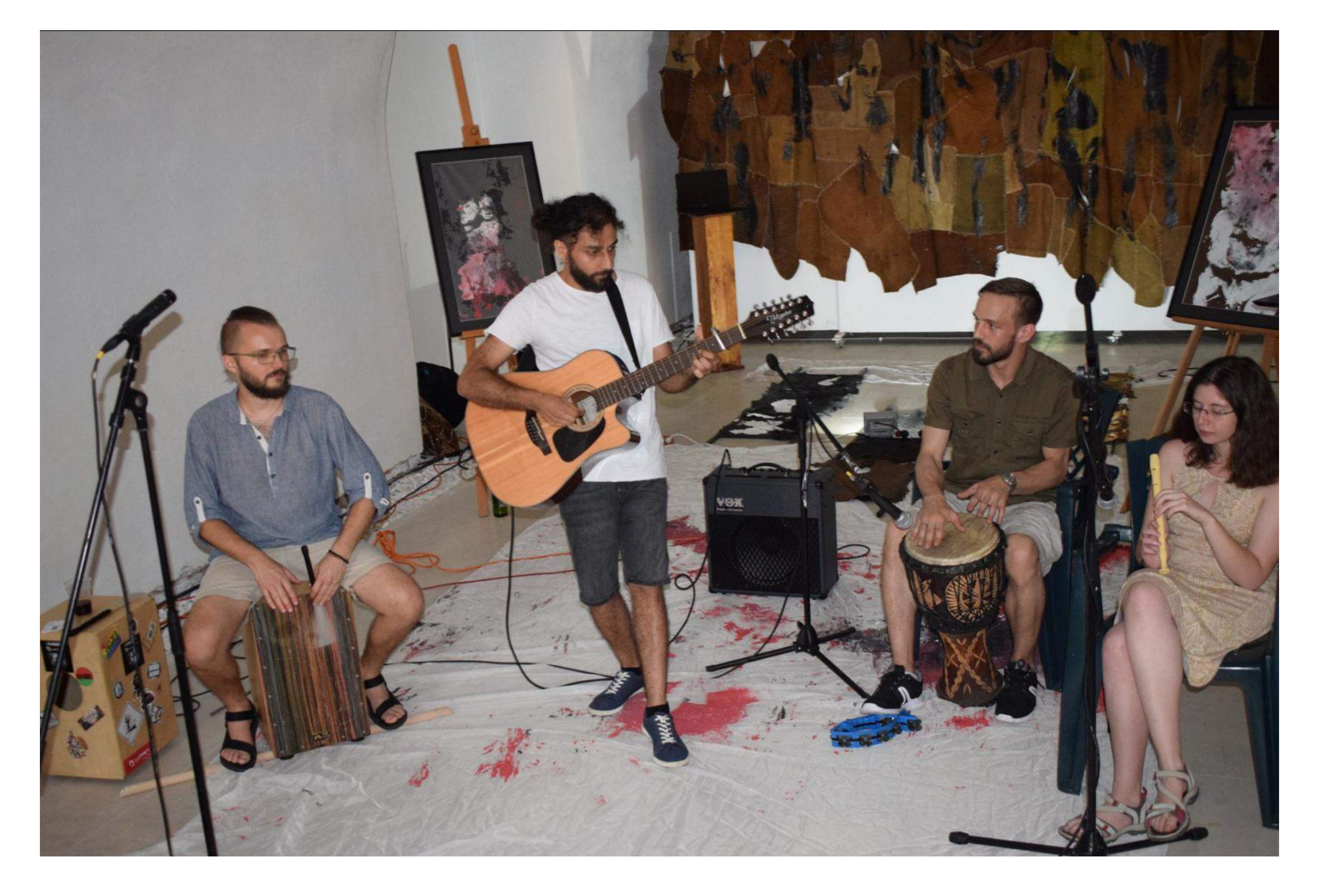
TRAF #3: Music Concerts