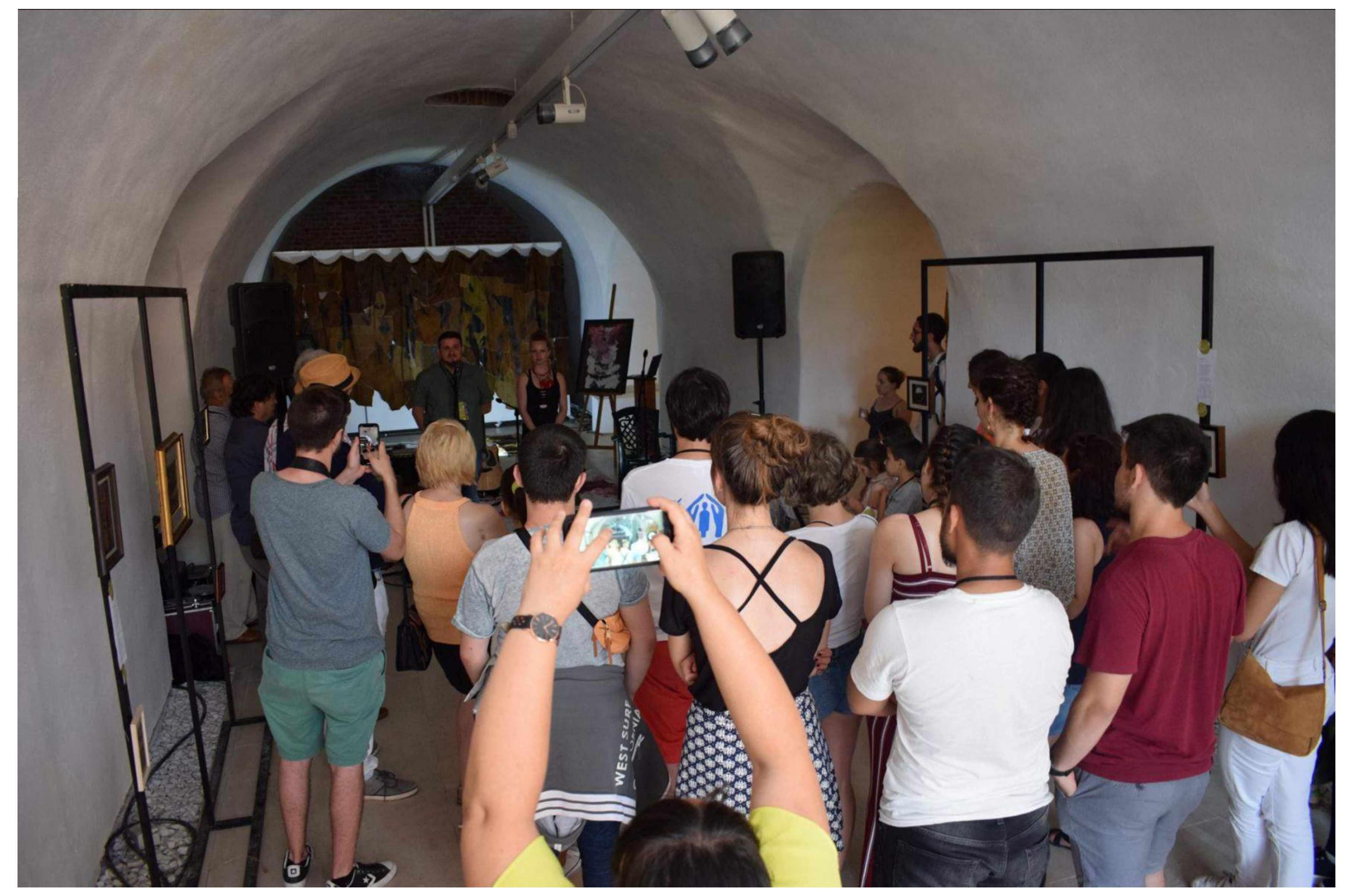
TRAF #3: Art Exhibition