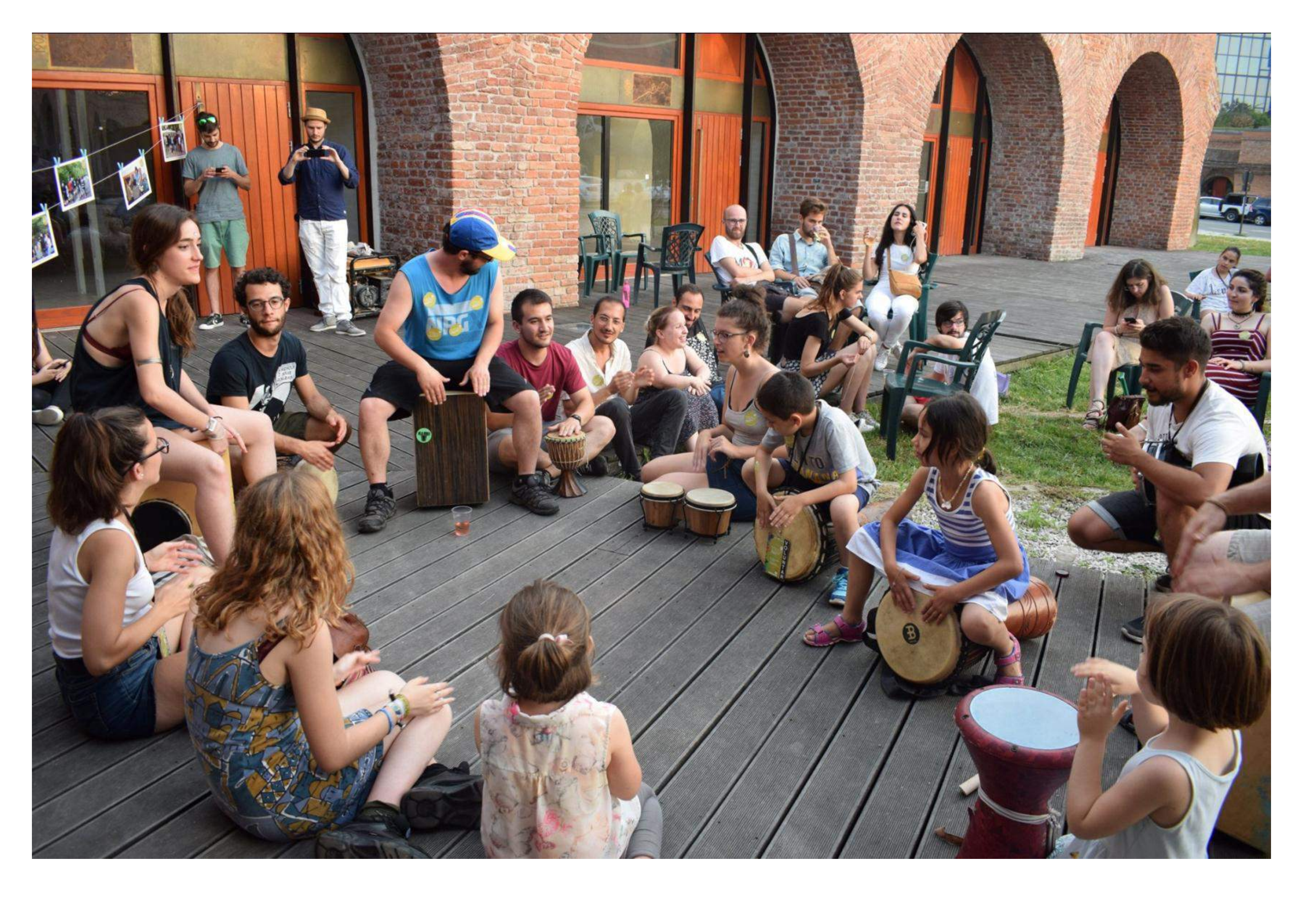
TRAF #3: Music Jam Session