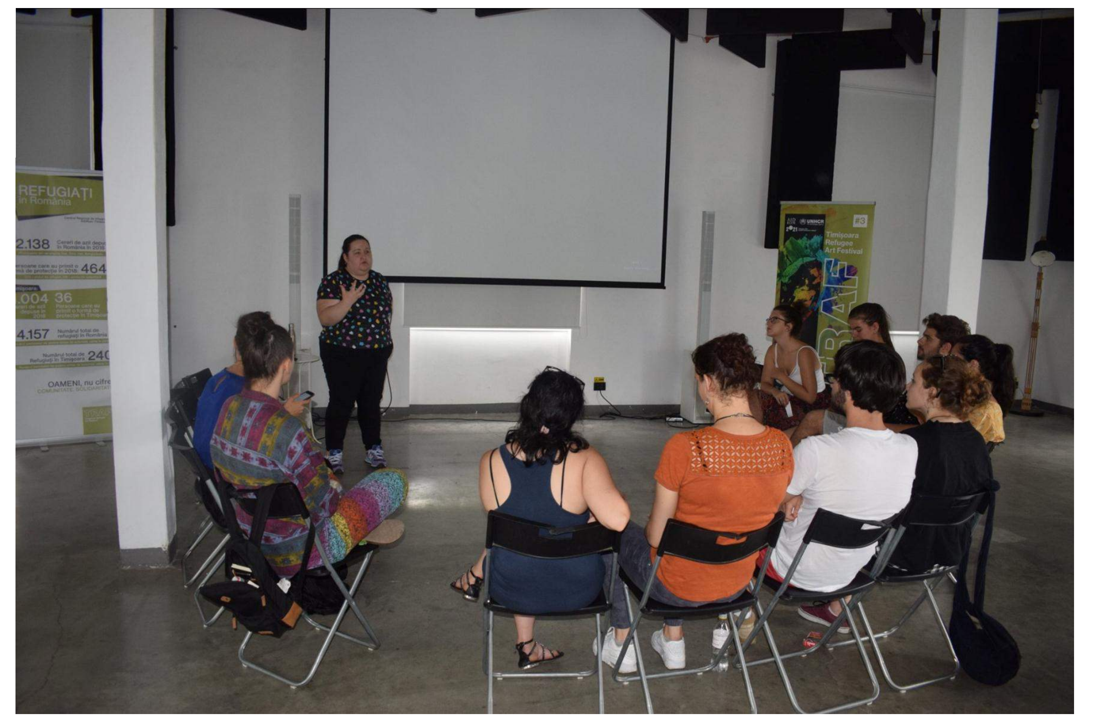
TRAF #3: Community Ateliers