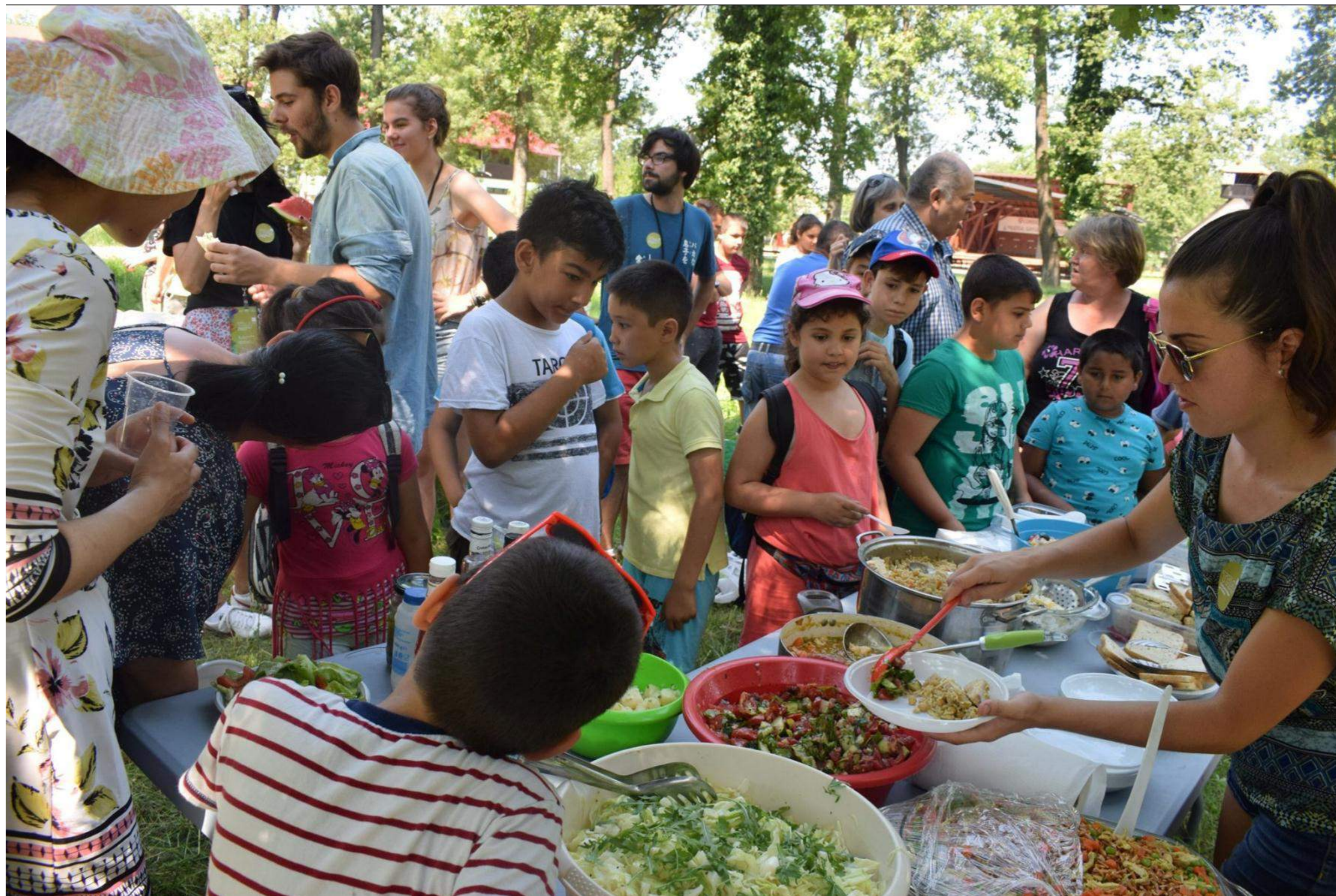
TRAF #3: Community Intercultural Picnic