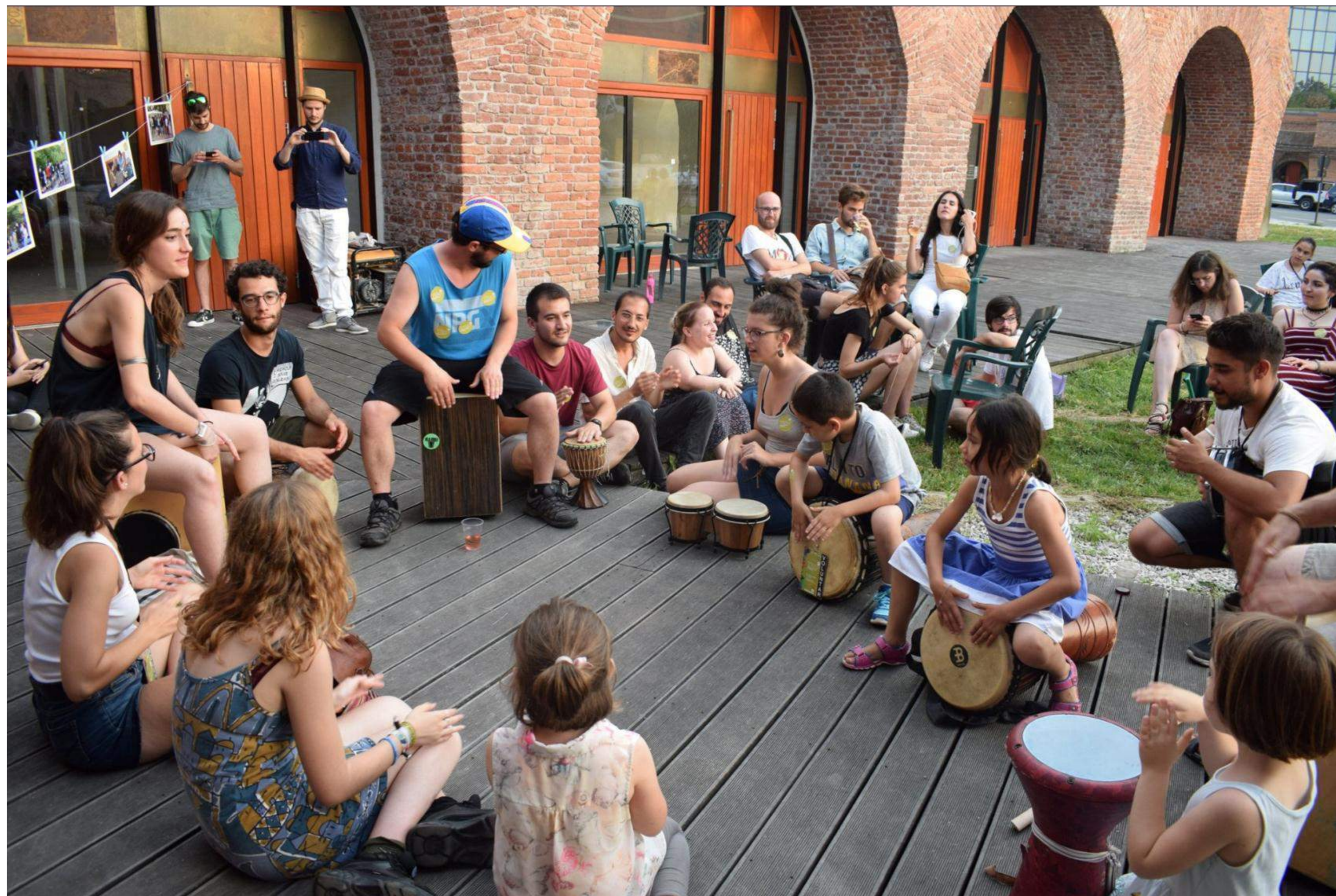
TRAF #3: Music Jam Session