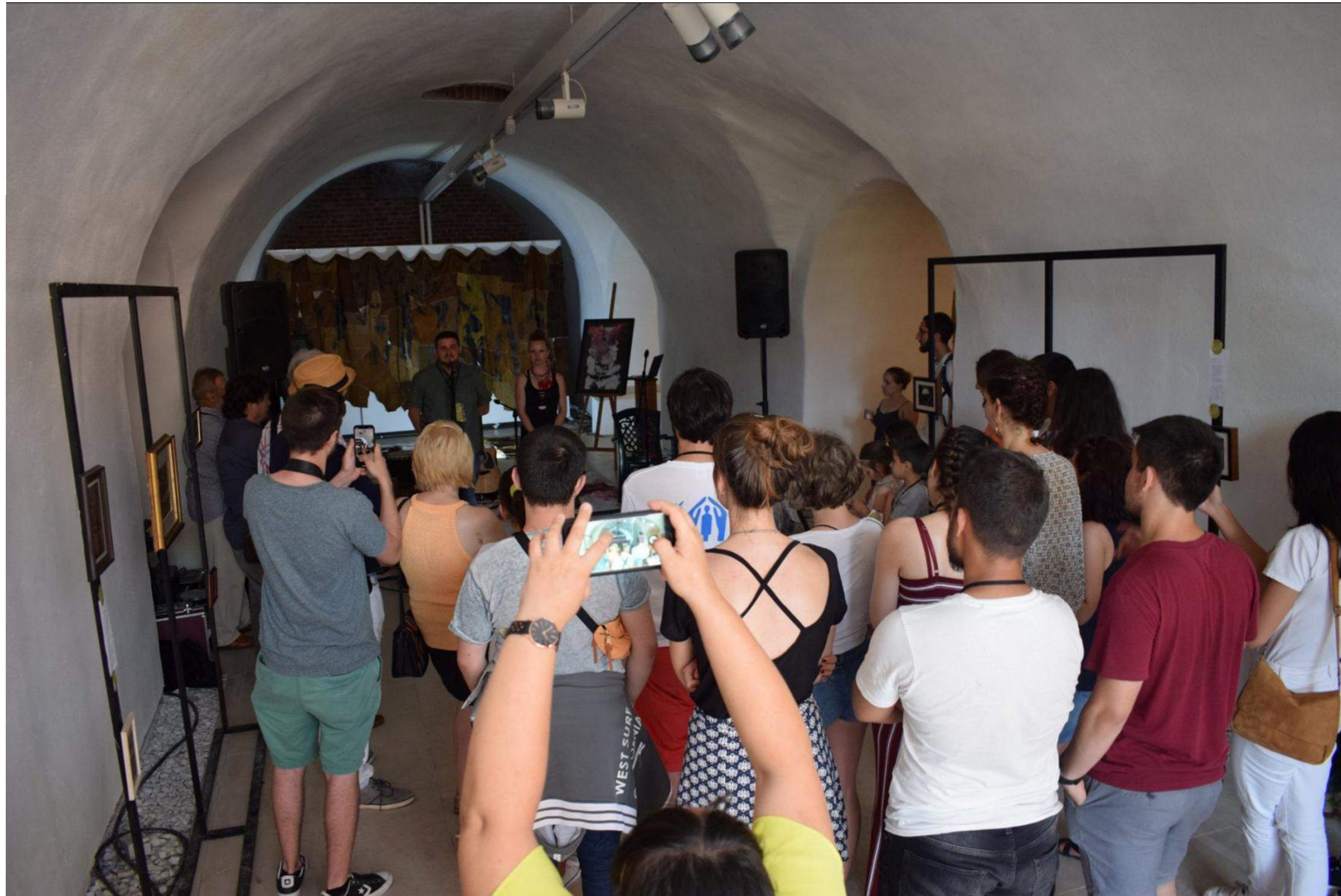
TRAF #3: Art Exhibition